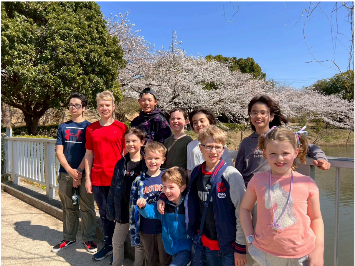
Nagoya Christian School

Pray for clarity of vision and wisdom as we lay the groundwork for our next church plant!