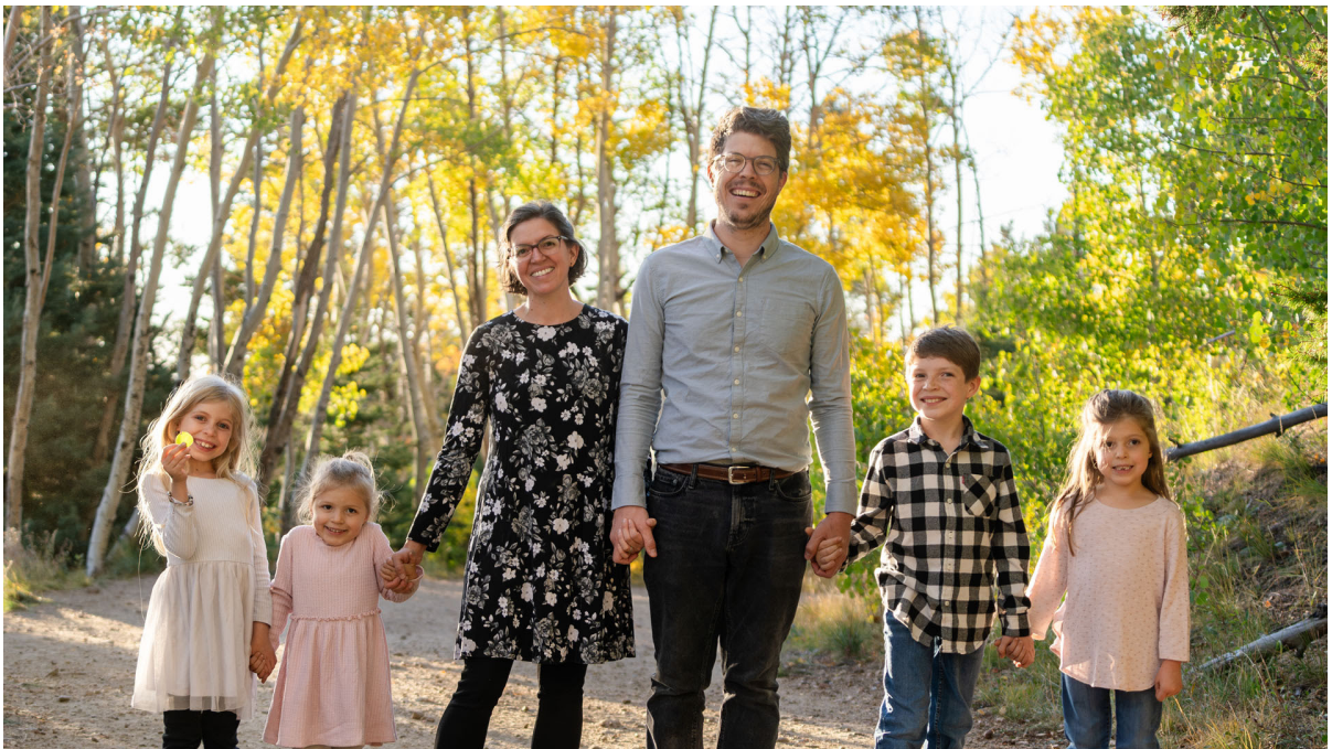
Nagoya Church Planting Team